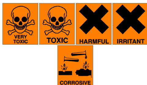
European system (pre-June 2015)